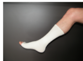
LAYER 2 FROM BASE OF TOES TO MID CALF