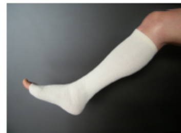
LAYER 1 FROM BASE OF TOES TO BACK OF KNEE