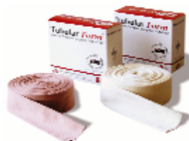
Tubular Form ™ Measuring guide (ankle circumference)