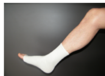
LAYER 3 FROM BASE OF TOES TO MID POINT BETWEEN MID CALF AND THE ANKLE