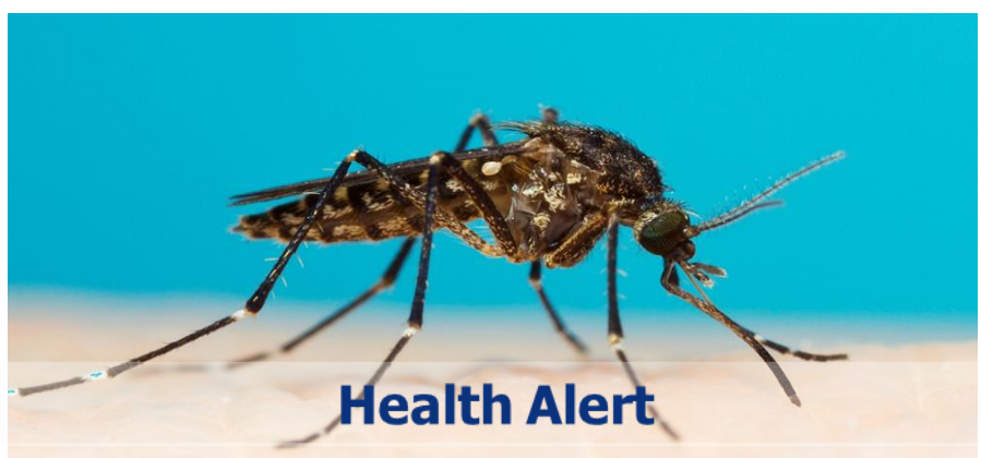
NSW Health is alerting fishers, campers and anyone experiencing the great outdoors that Ross River virus has been found in mosquitoes in the Georges River area. The SESLHD Public Health Unit has issued a warning...

Community concern about cancer arising because some consumer products are contaminated by carcinogens is generally disproportionate compared to cancer risks attributable to smoking, alcohol drinking, and sun exposure or to overweight/obesity and lack of exercise. The last review of findings that give rise to concern about cancer from consumer products was published in 1981; a systematic search of the literature is being undertaken to allow the preparation of a contemporary review.