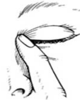
Figure 3 - stopping eye drops doing down nose