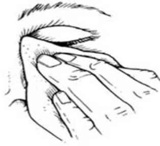
Figure 1 - cleaning the eye

Wipe your eyelids with a clean folded tissue dipped in cooled boiled water. Clean from the nose towards the ear. If the eye is still sticky, clean again with a clean tissue.